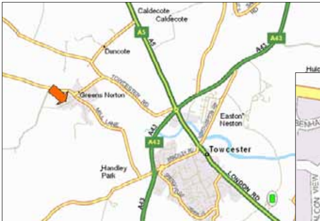
(Greens Norton Methodist Hall)