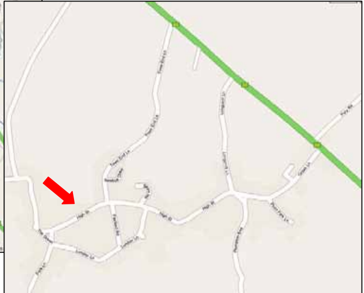
(Paulerspury Village Hall)

For more information please go to www.towcestercameraclub.co.uk or contact: